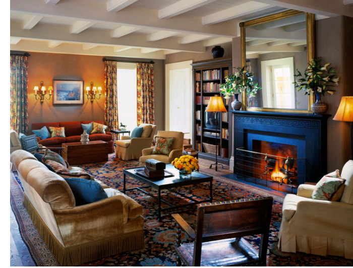
From the left: formal living room in Charleston; modern living room in Southampton; territorial style sitting room in New Mexico