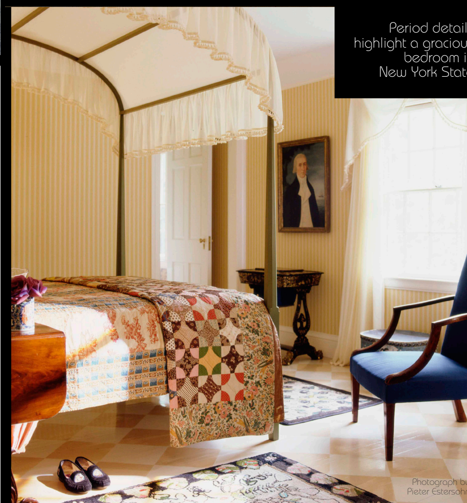
Period details highlight a gracious bedroom in New York State

Another example of my work on historically accurate rooms is a bedroom within a house in New York State. It is seemingly from the nineteenth century with painted floors, period curtains, bed hangings and wonderful nineteenth-century portraits. In this instance, the combined period details produce a kind of up-to-date feeling.