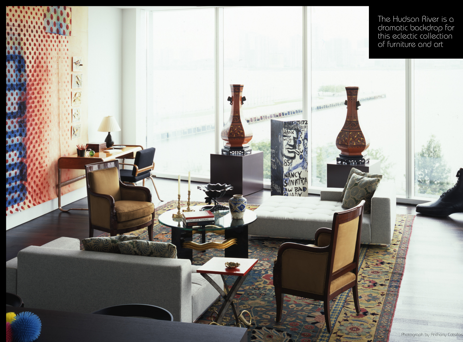
The Hudson River is a dramatic backdrop for this eclectic collection of furniture and art