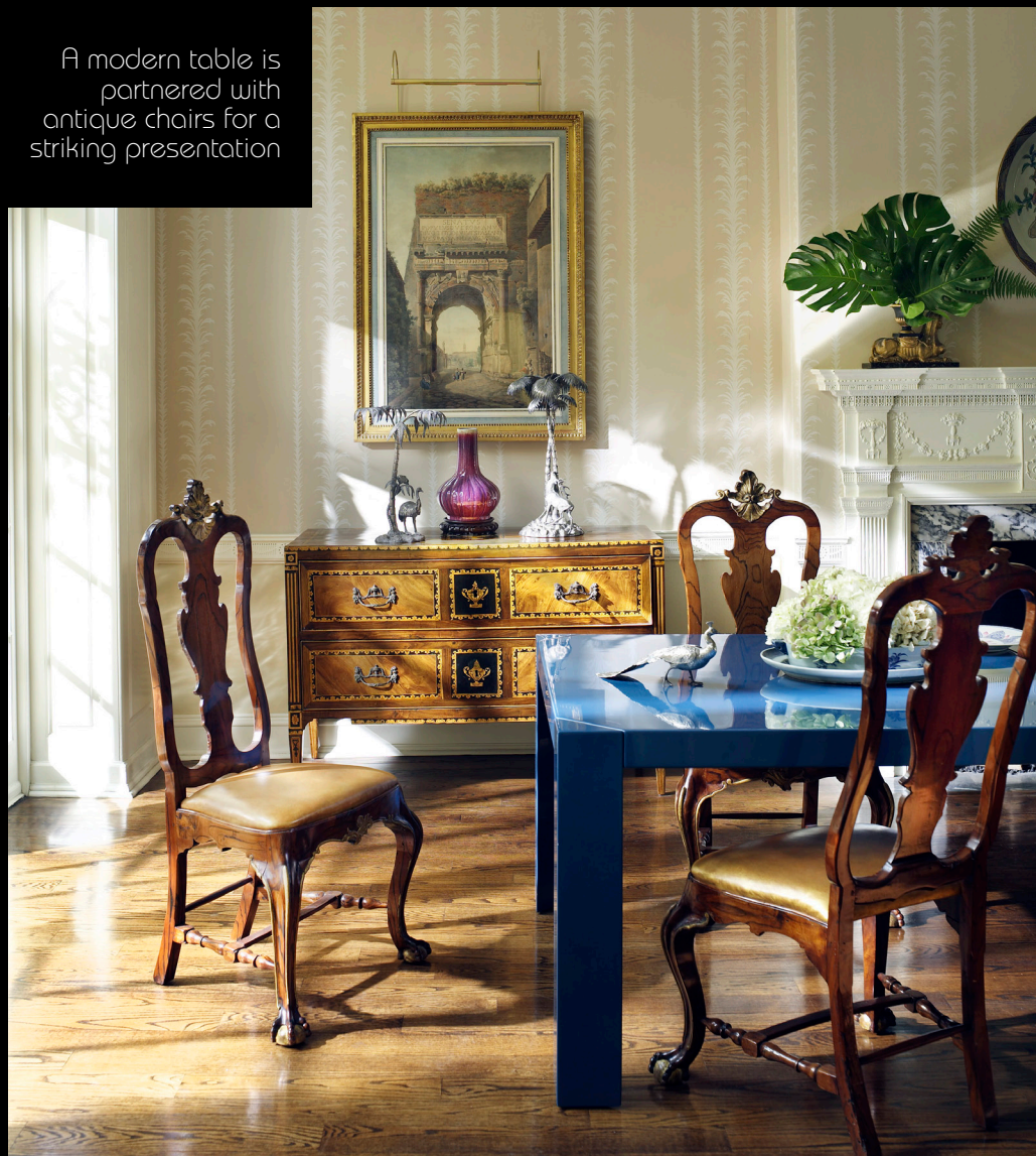
A modern table is partnered with antique chairs for a striking presentation