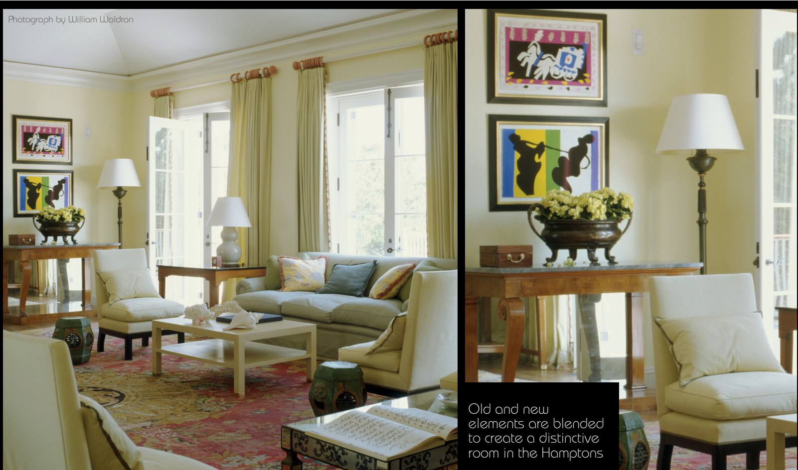
Old and new elements are blended to create a distinctive room in the Hamptons