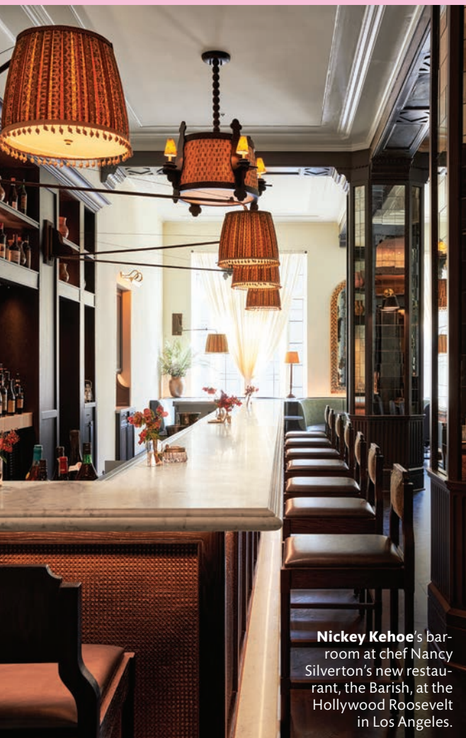
Nickey Kehoe's bar-room at chef Nancy Silverton's new restaurant, the Barish, at the Hollywood Roosevelt in Los Angeles.